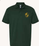
Hunter Green / Verde Oscuro