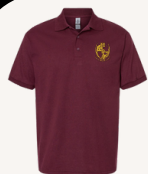
Maroon / Guinda