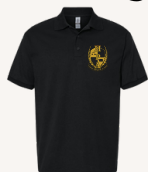
Black / Negro