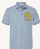
Gray / Gris