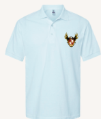
White / Blanco