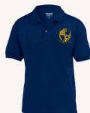
Navy Blue / Azul Marino